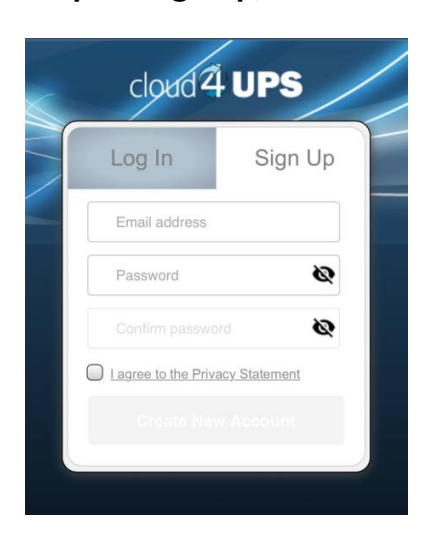
Step 2: Sign up, activate account and Login